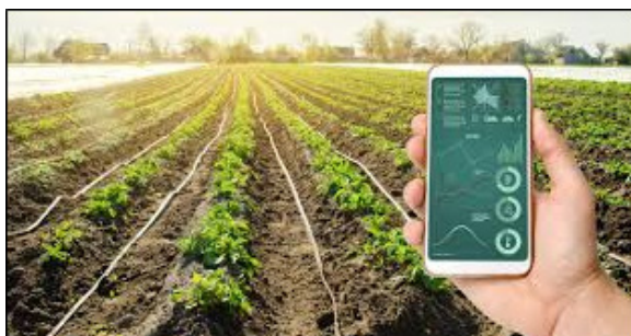
Fig. 2 Monitoring soil and crop health in field

The type of soil and essential nutrient of soil plays an important factor in the type of crop is grown and the quality of the crop. Due to increasing deforestation day by day, soil quality is degrading and it is hard to determine the quality of the soil. A German-based tech startup Progressive Environmental and Agricultural Technologies (PEAT) has developed an AI-based application called Plantix that can identify the nutrient deficiencies in soil including plant insect-pests and diseases by which farmers can also get an idea to use fertilizer for control which helps to improve harvest quality of food. This app uses image recognition-based technology. The farmer can capture images of deficit plant part using their Smartphone's. We can also see soil reclamation techniques with tips and other best solutions through short videos on this application.