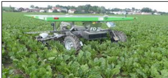
Fig. 4 Agricultural robot working in field

AI companies are developing robots that can easily perform multiple tasks in farming fields and helps farmers. This type of robot is trained to control weeds and harvest crops at a high speed with higher volumes compared to humans. These types of robots are trained to check the quality of food crops and detect weeds with picking and packing of crops at the same time. These robots are also capable to survive the challenges faced by agricultural labor.